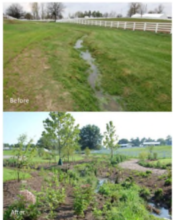
Riparian buffer project at the Kentucky Horse Park, in the Cane Run watershed of the Kentucky River Basin, in Fayette County

The KY DOW Watershed Watch webpage is a great resource with training offered to the public.